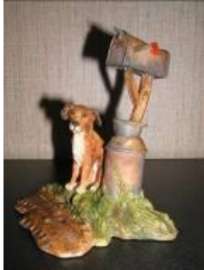
25030 – Country Road