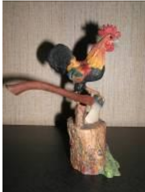
25031 – Ignorance is Bliss