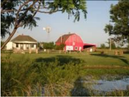
Dalton Homestead and Red Barn