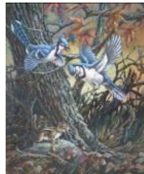
Blue Jays and Chipmunk (1975)