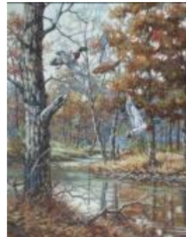
Taking Flight (1977)