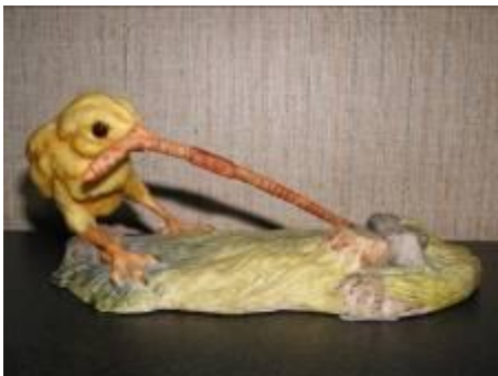
25033 – Fowl Play