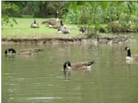
Canadian Geese on Remus Pond

of the families of Canadian geese came to the ponds at Red Oak II to continue to raise them over the summer in preparation for their fall migration.