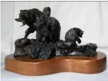
The Good Provider (1974 – 30 castings)