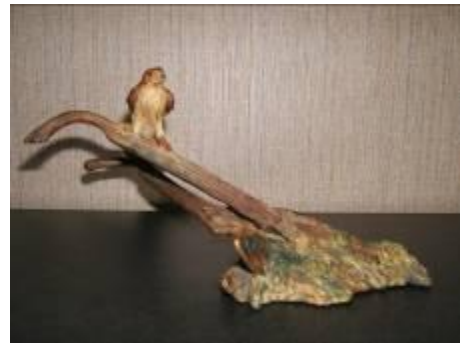
25035 – Broken Dreams

Do you have all of them in your collection?