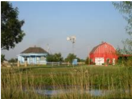
Dalton Homestead newly painted blue

We needed a blue building at Red Oak II and now we have one! Lowell says, "It looks like a piece of cake." Work at the South end of Red Oak II is now focused on converting the Chicken Museum into the Red Oak II train station.