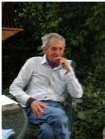
The Birthday Boy