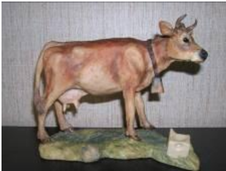
25032 – Blossom

We have recently acquired some awesome Lowell Davis bronzes from some collectors that were downsizing their collections. Many of these were cast by Schaefer Art Bronze Casting in Arlington TX. We have added all of these to the www.redoakiimissouri.com web site but wanted to share some photos of a couple of Lowell's magnificent wildlife bronzes.