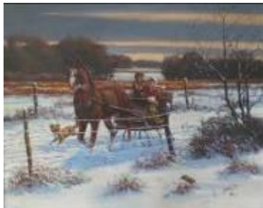
What Rat Race? (1983)