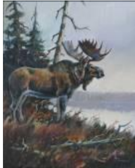
Northern Lake (1974)