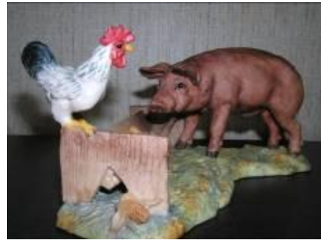
25034 – Slim Pickin's