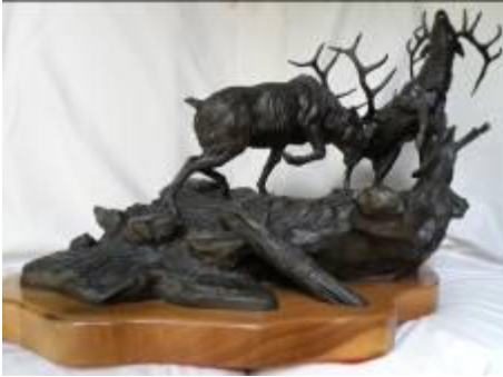
Fighting Elk (1974 – 30 castings)