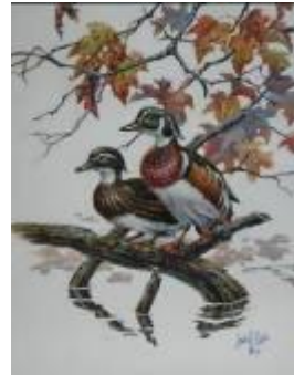
Pair of Woodies (1975)

We are still looking for additional Lowell Davis bronzes so if you have any for sale, please send an email with details to: redoakiigeneralstore@att.net .