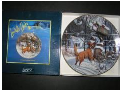
Hooker at Mailbox with Presents (Collectors Plate) 24100