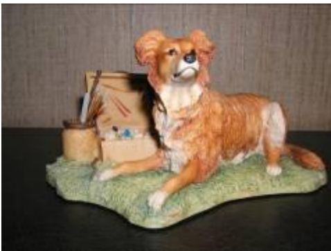
A Tribute to Hooker 25340