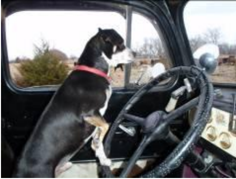
Oggie fantasizing about driving Emery "Look ma, just one hand!"