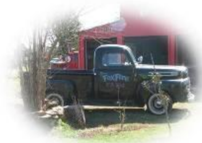
Pick 'em up Truck