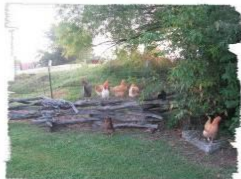
Just us Chickens