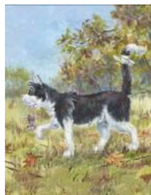
"A Gift for You"