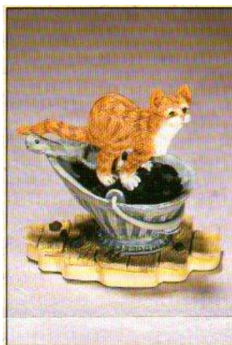
"Grandpa's Ole Tom" (97/98 Club Figurine) 97008

The piece was to have been a cat using a coal bucket for a litter box.