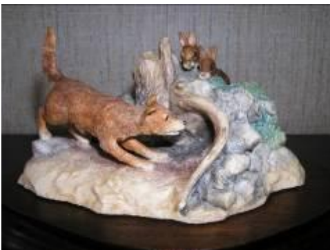
Two in the Bush 25337