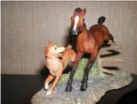
Feelin' His Oats 25275