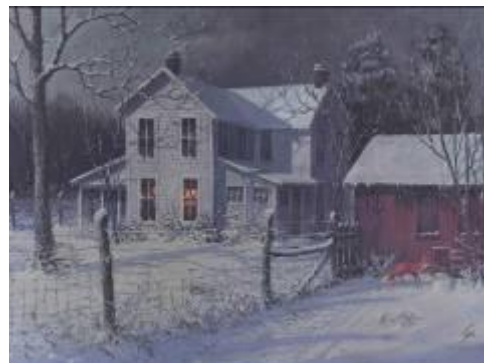
"Supper Time"