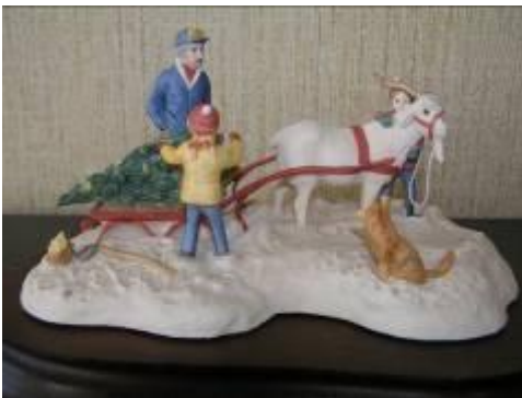
Cutting the Family Christmas Tree 23555