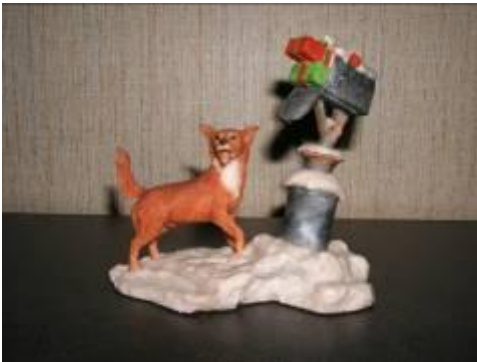
Hooker at Mailbox with Presents 23550