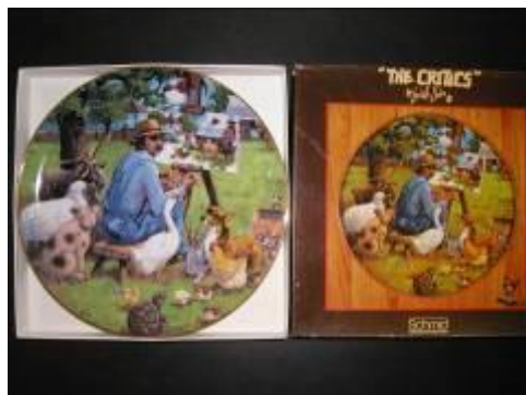
The Critics (Collectors Plate) 24015