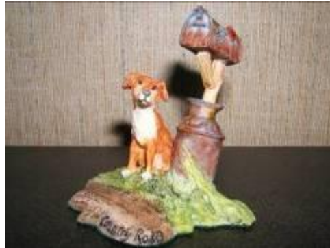
Country Road (15 th Anniversary Edition) 96842