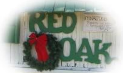
Welcome to Red Oak II