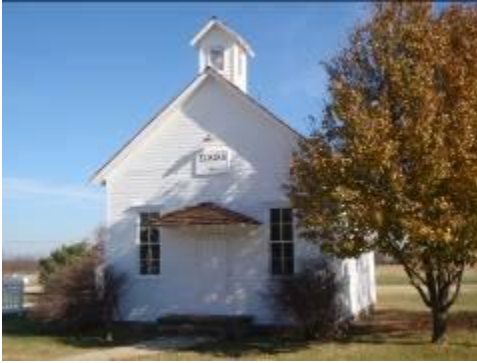
Elmira School House, Red Oak II

In 2009, we will focus on renovation of the General Store and getting the Lowell Davis Art Gallery open. You should plan on visiting Red Oak II in 2009 to see all the improvements!