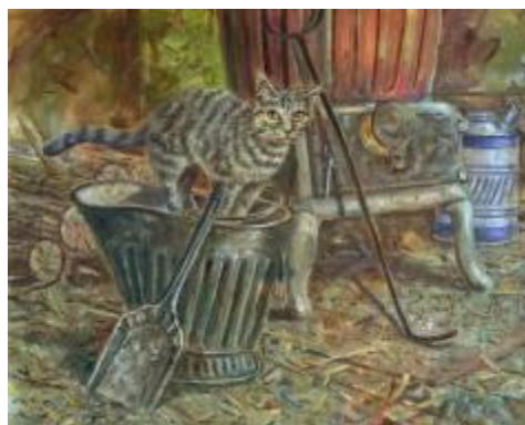
"Grandpa's Ole Tom"