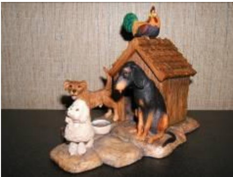
City Slicker 25329