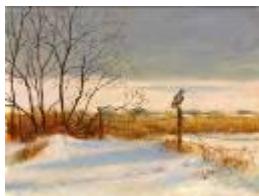
The North 40