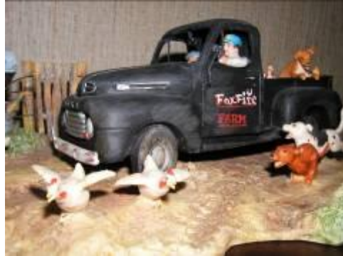
Home from Market 23601