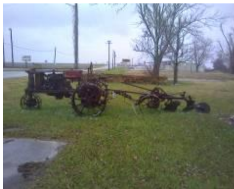
Tractor and Plow for Lowell's Jasper MO sculpture with stone base in background

The tractor and plow for Lowell's sculpture are ready for mounting on the stone base but he is still waiting for the farmer and dog to be cut out in steel.