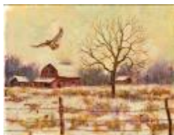
The Ole Massy Place