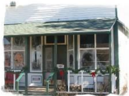
Red Oak II General Store