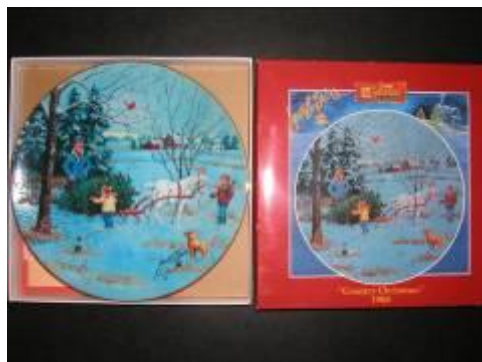
Cutting the Family Christmas Tree (Collectors Plate) 24105