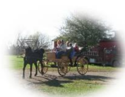
Old Fashioned Buggy Ride