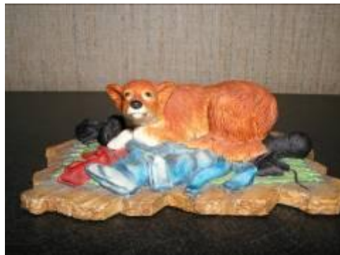
His (The) Master's Dog 25244