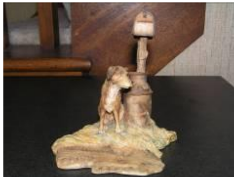
Country Road 25030