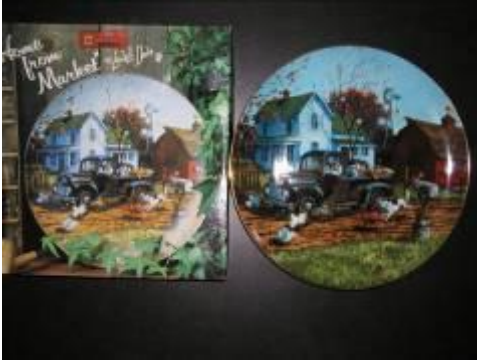
Home from Market (Collectors Plate) 24016