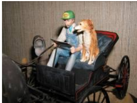
From a Friend to a Friend 23602