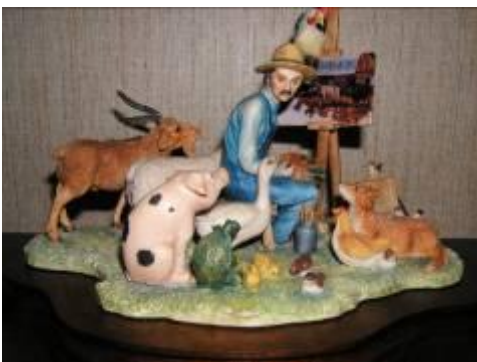
The Critics 23600