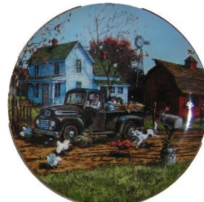
"Home from Market"

Original Oil Painting / Giclée Prints, Porcelain Figurine (Ltd Ed of 1,200) and Collectors Plate (Ltd Ed of 7,500)