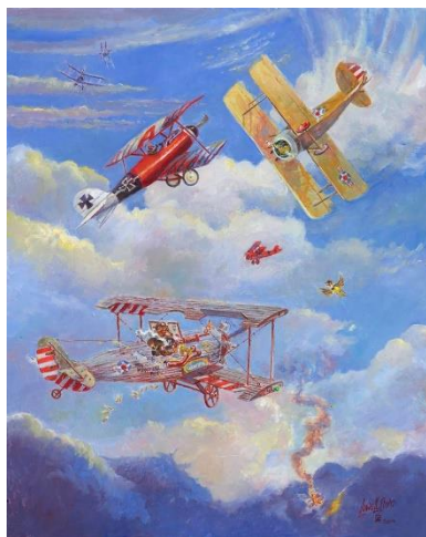
"Friendly Fire" Original Oil Painting / Giclée Prints