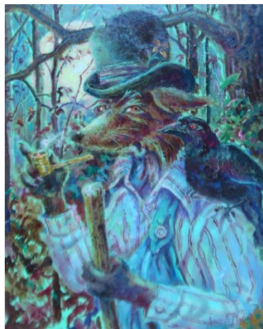
"A Crow Told Me - Early" Original Oil Painting