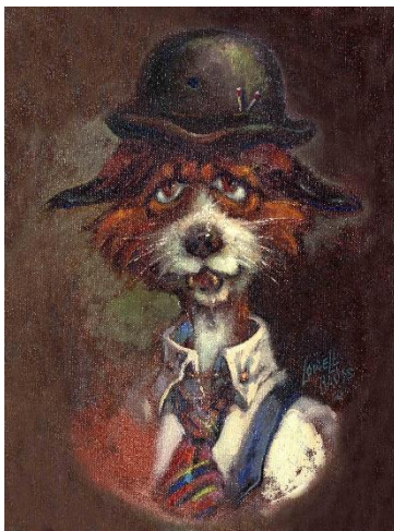
"The Missoura Kid as Young Man" Original Oil Painting / Giclée Prints